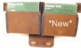
Double Shell Pouches Clips on Bolt