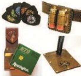
Accessories Binders, Magnet Pads, Clips, and more!