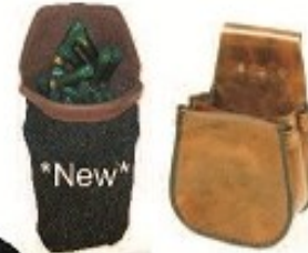
Mesh & Leather Empty Pouches

NEW Club-Team Program Special pricing with minimum order Call for details.