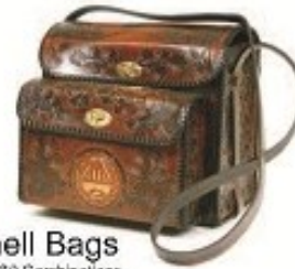
Shell Bags Over 80 Combinations