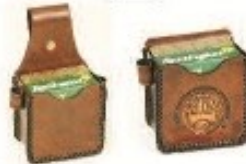
Single Shell Pouches Over 30 Combinations